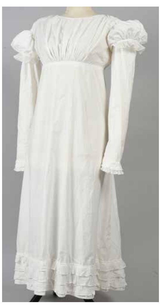
8th & 9th OCTOBER