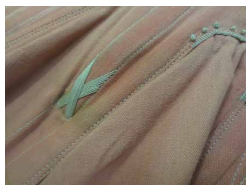
12th to 17th SEPTEMBER