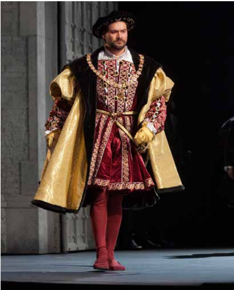
Ildar Abdrazakov as Henry VIII (Enrico) in Donizetti's Anna Bolena.