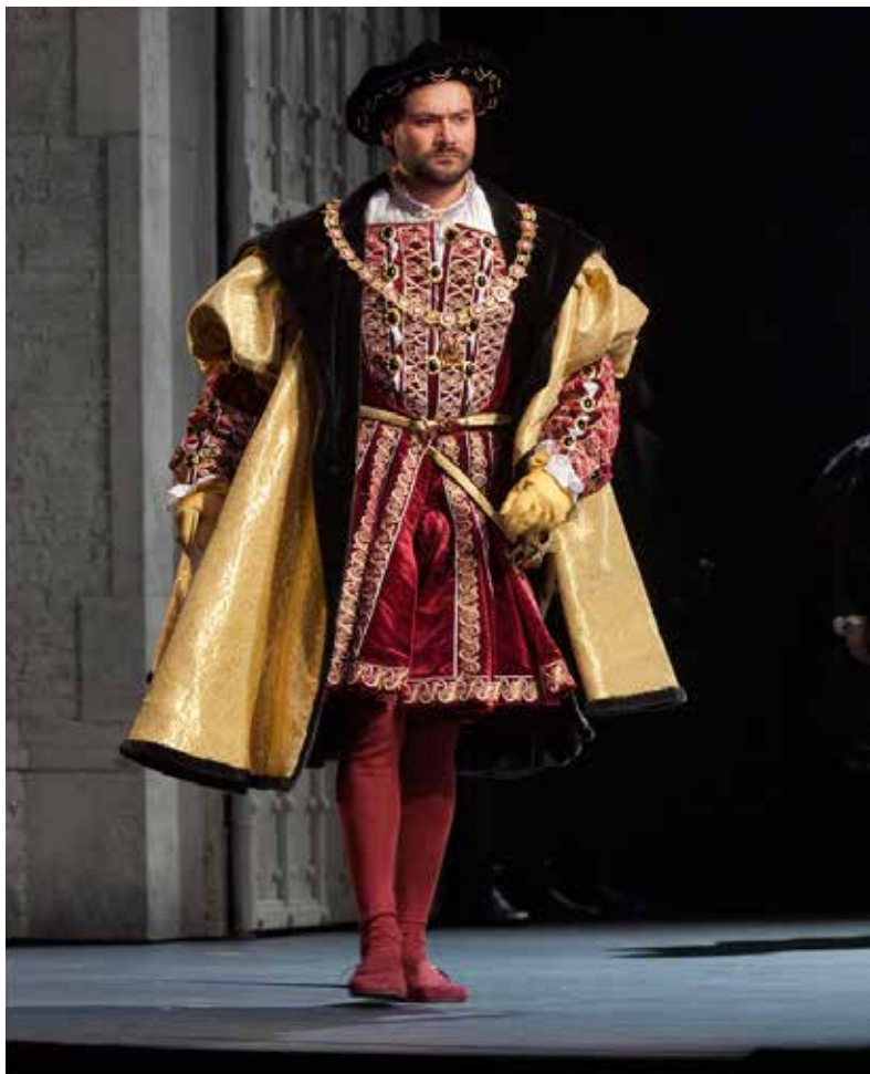
Ildar Abdrazakov as Henry VIII (Enrico) in Donizetti's Anna Bolena.